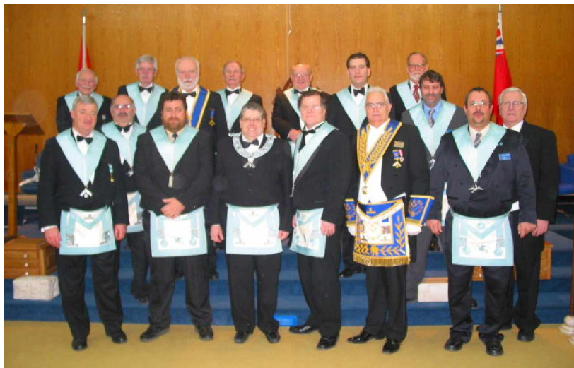
The new Officers for 2011-2012 Masonic Year