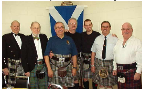
Wearing their colours in front of Scotland's St. Andrew's Cross