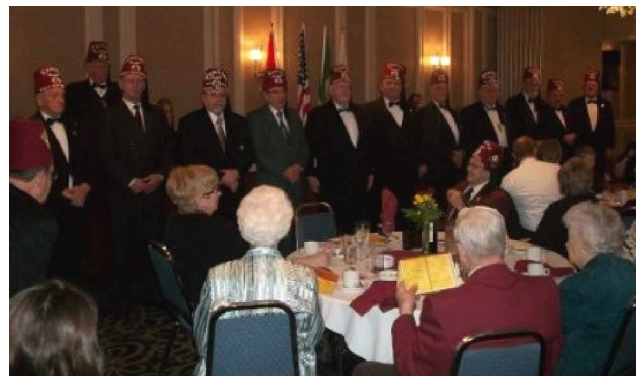
Sudbury Shrine Club 2011 Executive