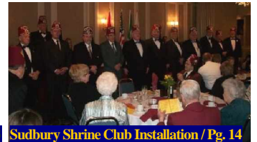
Sudbury Shrine Club Installation / Pg. 14