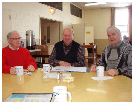
Anxiously waiting the sumptuous Bill o' Fare to begin