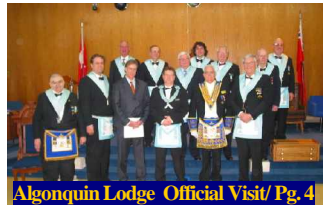
Algonquin Lodge Official Visit/ Pg. 4