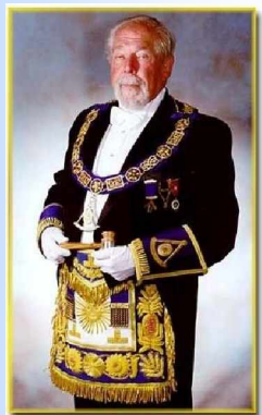
Invitation to Grand Master's Reception/ Pg.2