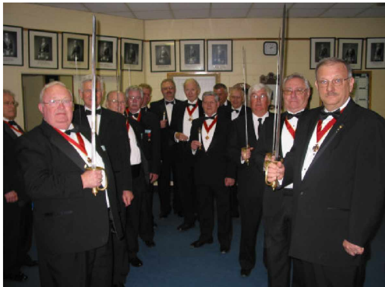
Degree Casts pose for pictures