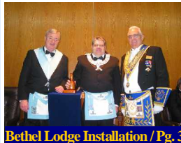
Bethel Lodge Installation / Pg. 3