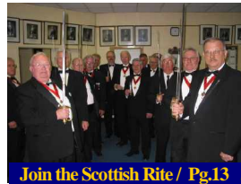
Join the Scottish Rite / Pg.13